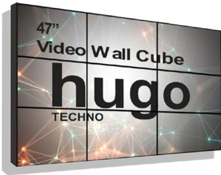
Model # 47 HT DW (3 x 3)