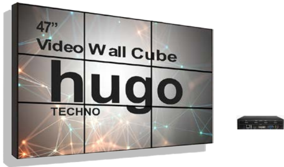
Model # 47 HT DW (3 x 3) with Controller