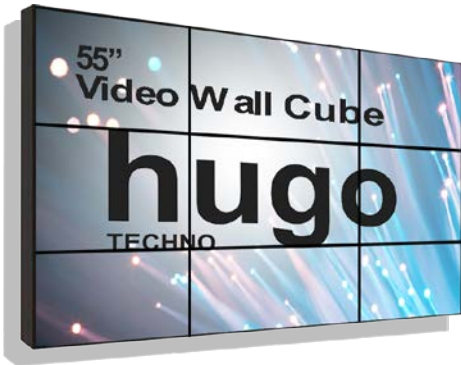
Model # 55 HT DW (3 x 3)