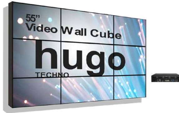
Model # 55 HT DW (3 x 3) with Controller